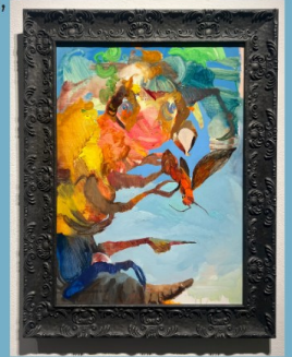
Exhibit Dates: March 14th - April 25th, 2026

In case you missed the DADA Art Crawl, our exhibit is always available to you in the Browsing Room. Go and feast your senses upon the creativity of our Artist's In Residence!